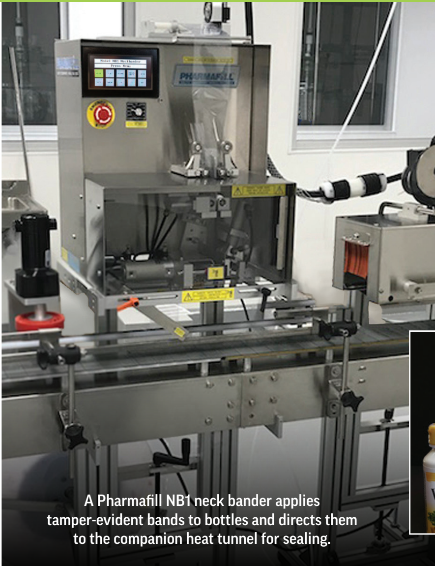
A Pharmafill NB1 neck bander applies tamper-evident bands to bottles and directs them to the companion heat tunnel for sealing.

The Pharmafill NB1 automatically applies tamper-evident bands and sleeve labels onto bottles, jars, vials, tins and other containers with unprecedented accuracy, reliability, and affordability. It's easy for any line operator to setup and operate, and hundreds of growing companies have found it's the easiest way to keep up with sales by upgrading from a manual to automated process.